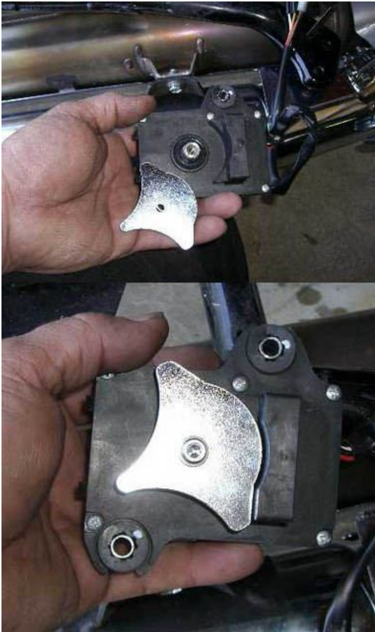
Install solenoid to Cobra bracket.